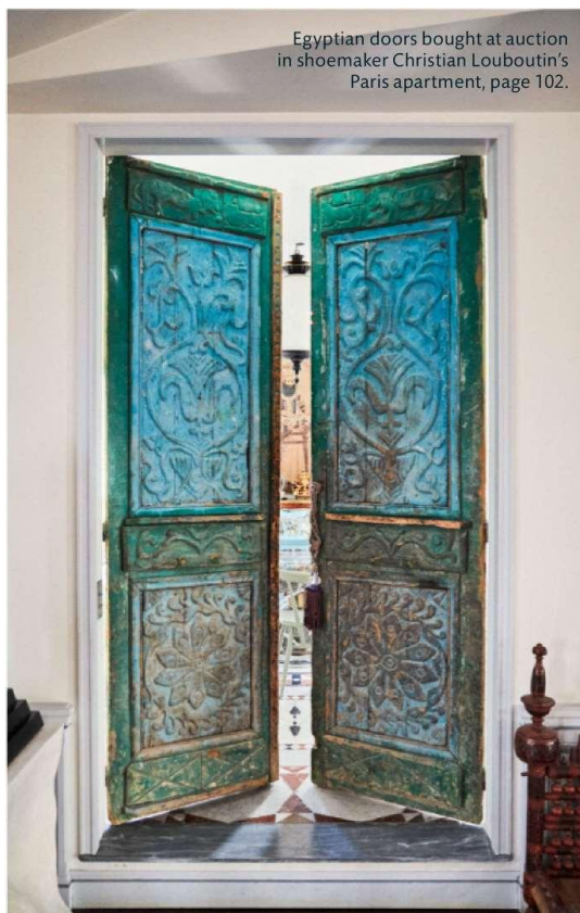
Egyptian doors bought at auction in shoemaker Christian Louboutin's Paris apartment, page 102.